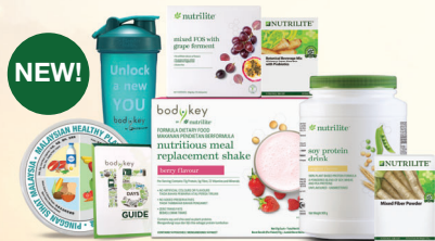
BodyKey Jump Start Kit (New Edition, 325779)

Purchase the BodyKey Jump Start Kit OR ALP subscription (each member to purchase one unit)