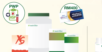
ALP Build-Your-Own (BYO) Solution 4 (322209)