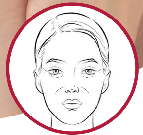
Fine lines and wrinkles

Did you know these are all signs of photoageing?