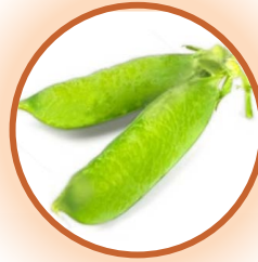
PEA SPROUT EXTRACT For healthier tresses and reduced hairfall 6