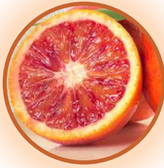
RED ORANGE EXTRACT For bright, radiant skin 1,2

contains nourishing ingredients to beautify you from head to toe: