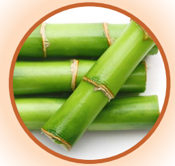
NATURAL BAMBOO EXTRACT For stronger nails 7,8