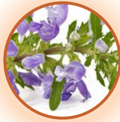
MOLDAVIAN DRAGONHEAD EXTRACT For improved skin moisturisation and elasticity 5