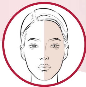
Uneven skin tone