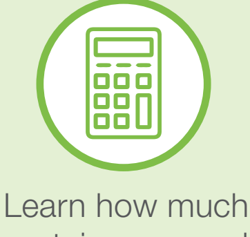
protein you need daily with this calculator HERE